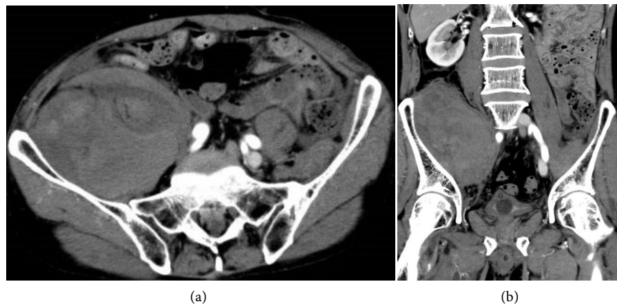
Figure 1. Contrast-enhanced CT showed a space-occupying lesion in the iliac fossa over the insertion site of the lesser trochanter in the iliac muscle in the right pelvic cavity, and the iliac muscle was markedly swollen. There was no contrast enhancement in the lesion or at the margin. (a) Axial view; (b) Coronal view.

Based on the acute development and imaging findings described above, femoral nerve paralysis induced by iliopsoas muscle hematoma, mainly in the iliac muscle, was suspected, and anticoagulant therapy was discontinued after the first examination at our department. The conditions of anesthesia and motor paralysis did not change, and Hb decreased from 12.8 to 6.0 g/100 mL on the 12th hospital day. Since improvement of symptoms was not expected, the patient was transferred to a higher-level medical center on the 15th hospital day and invasive removal of the hematoma was performed on the same day.