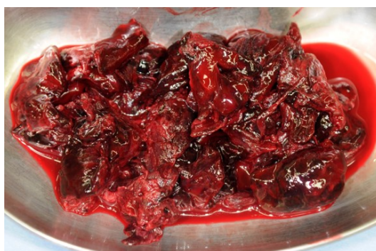
Figure 2. The iliac muscle was markedly swollen and a large blood clot (weight 150 g) was excised when the fascia was manually incised.

Right lower abdominal pain resolved immediately after surgery and the patient became able to extend the hip joint and adopt a supine position. Ambulation using a wheelchair was achieved on the day after surgery and the patient started walking training 5 days after surgery. He became able to walk independently with a cane 14 days after surgery and continued walking training and muscle strengthening exercise after discharge. Hematoma had disappeared on CT performed 3 months after surgery ( Figure 4 ), and muscle strength at 6 months after surgery had a MMT score of 5 for the quadriceps muscle, showing improvement with slight remaining dysesthesia.