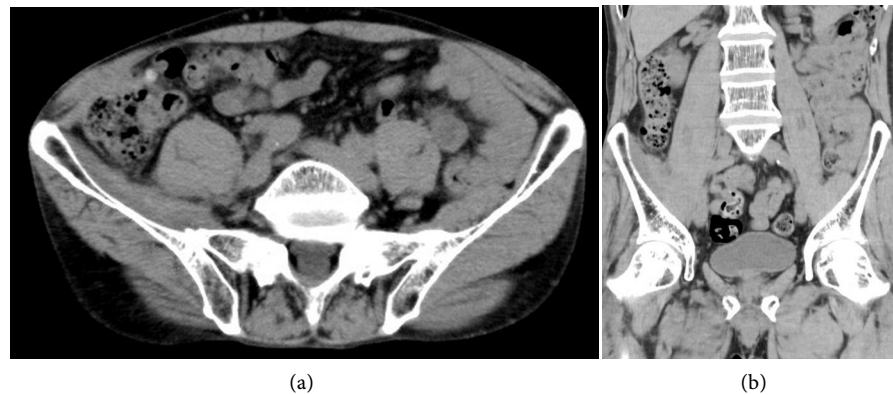
Figure 4. Hematoma had disappeared on CT performed 3 months after surgery, and muscle strength at 6 months after surgery had a MMT score of 5 for the quadriceps muscle, showing improvement with slight remaining dysesthesia. (a) Axial view; (b) Coronal view.