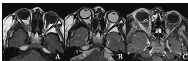
Fig. 3 Follow-up magnetic resonance imaging (MRI) scans 5 years after surgery

A: intraorbital view. B: view of right frontotemporal craniotomy. C: view of right frontotemporal craniotomy after tumor resection. a: tumor, b: left optic nerve, c: right optic nerve and tumor, d: stump of the cut right optic nerve