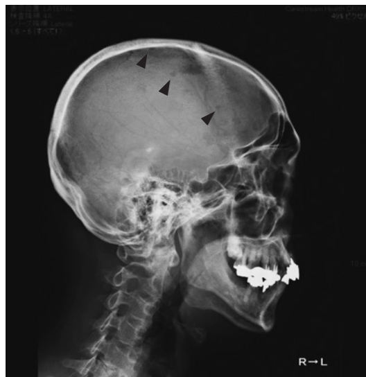
Fig. 2 Skull X-ray showing punched-out lesions (arrowheads).

was described as granular sparkling, which suggested cardiac amyloidosis (Fig. 1). The ejection fraction of the left ventricle was normal. On cardiac catheterization, the mean aortic valve pressure gradient was 60.4 mmHg, and the aortic valve area was 0.84 cm 2 . The coronary arteries were intact. Laboratory data included brain natriuretic peptide (BNP) of 254.7 pg/ml. The blood coagulation system and immunoglobulins were normal, with no cytopenia. Punched-out lesions were observed on skull X-ray (Fig. 2).